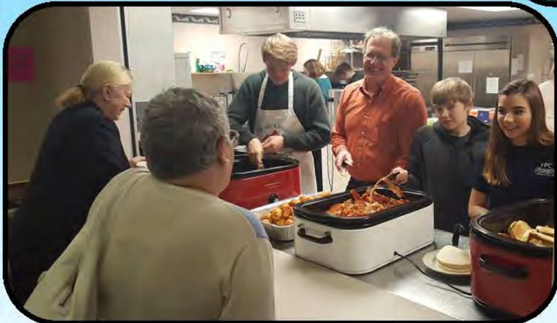
Thank you for your support and fellowship with us! We raised $1291!