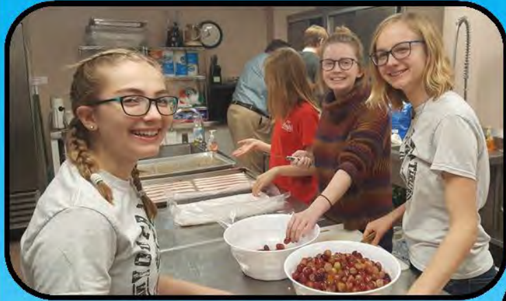
Fellowship Breakfast Youth Fundraiser!