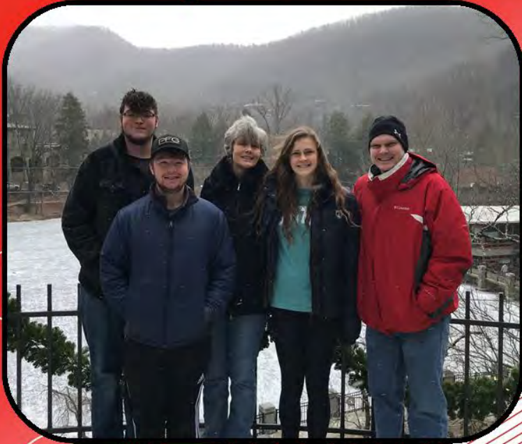
Montreat College Conference