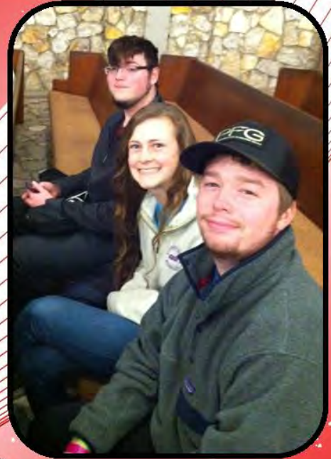
Senior High Overnighter